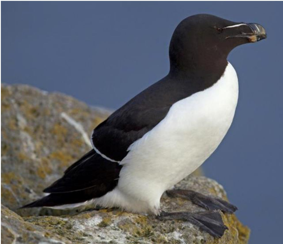
Razorbill in the wild (above) and Y1601 (below, before treatment). Shows the faded black feathers and taxidermy mistakes especially in the feet and body shape.