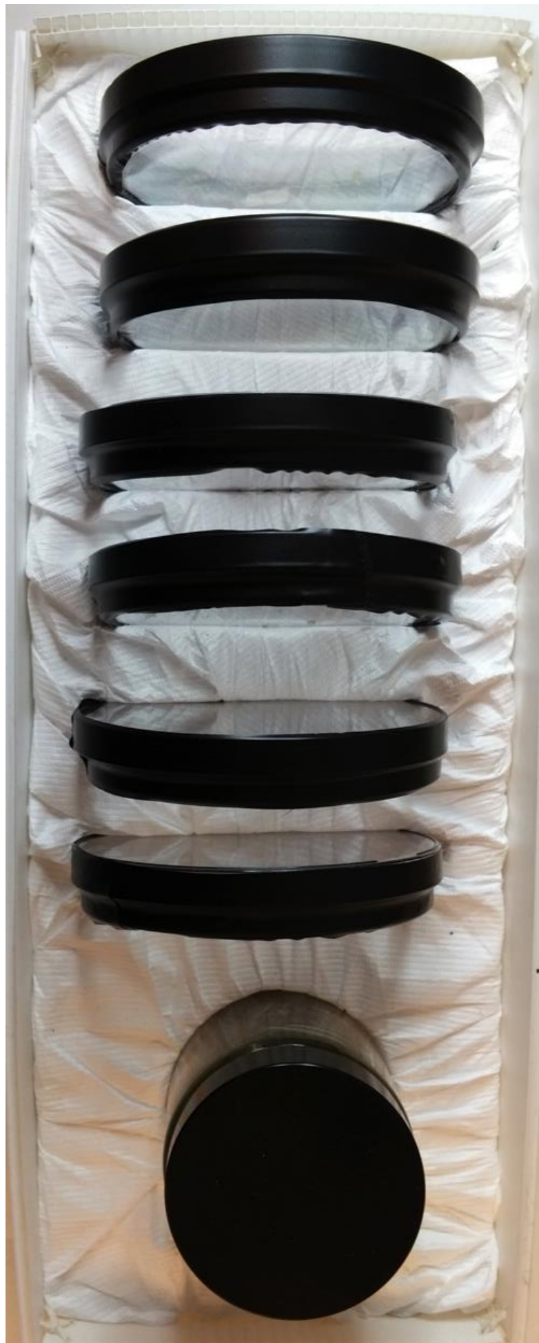
Tray with Material from Razorbill Diorama (Y1601), Grant Museum of Zoology

Shows the condition of the bottom of the diorama at the beginning of treatment